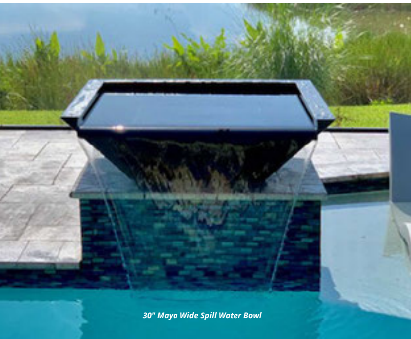
30" Maya Wide Spill Water Bowl