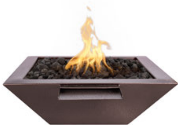
24" COPPER VEIN