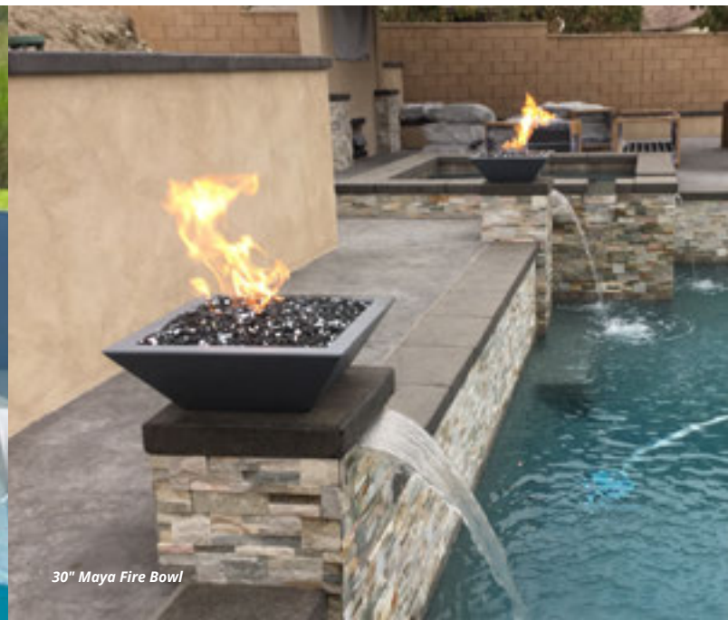
30" Maya Fire Bowl